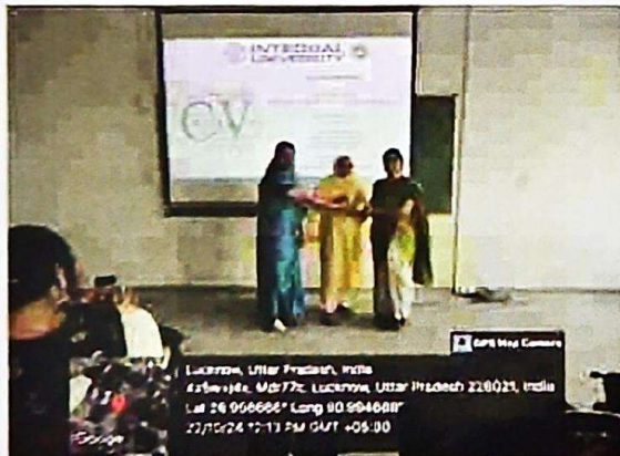
Welcome with a sapling to the Resource Person